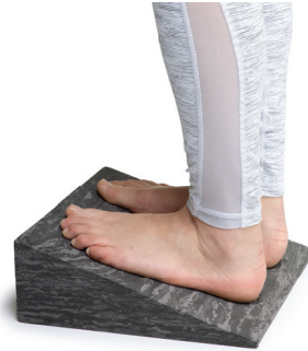
OPTP® PRO-SLANT™ (Item #4971)