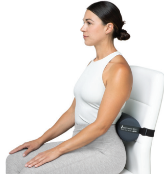
The Original McKenzie® Lumbar Rolls™ (Item #s 701-710)