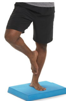
OPTP® Pro Balance Pads (Item #s 477-478)