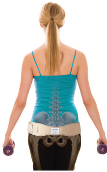
SI-LOC® (Item #s 670-671)