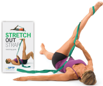
Stretch Out Strap® (Item #440-2)