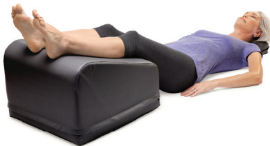
Professional Wedge™ (Item #01613, 01615, 02013, 02015)